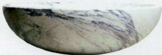
'Ellipse' bath, £18,000, Lapidica